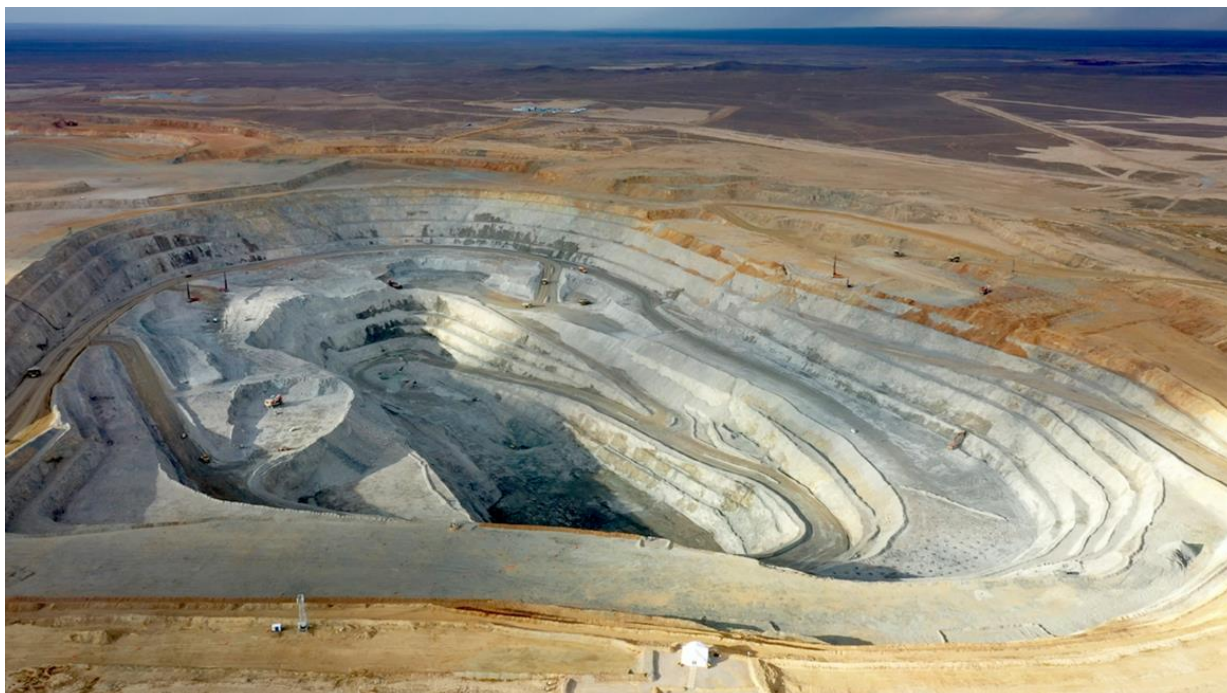
Aktogay Open Pit Mine. The Aktogay Camp hosts >12Mt contained copper and produced 252kt of copper in 2023. The operation has annual processing capacity up to 50Mt and an estimated mine life of 25 years.